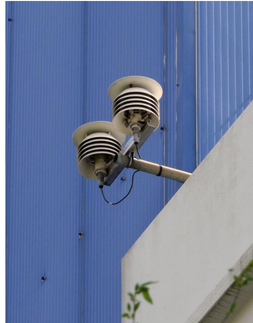
Fig. 3 - Lato nord dell'edificio 'B' e sensori di temperatura e di umidità relativa.