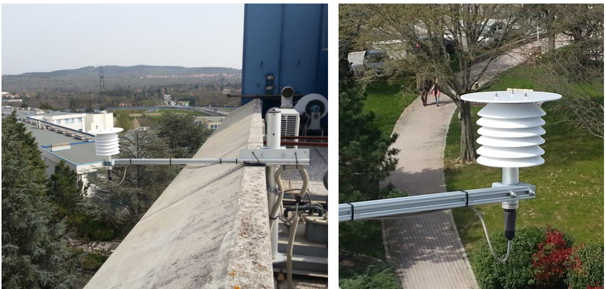
Fig. 6 - La stazione meteorologica Nesa: termoigrometro UTA-N.