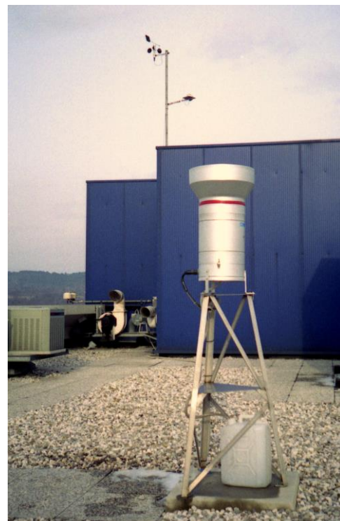
Fig. 4 - La stazione meteorologica Micros: (1) unità di acquisizione dati e modem; (2) sensori di temperatura e umidità relativa dell'aria; (3) anemometro e piranometro; (4) pluviometro.