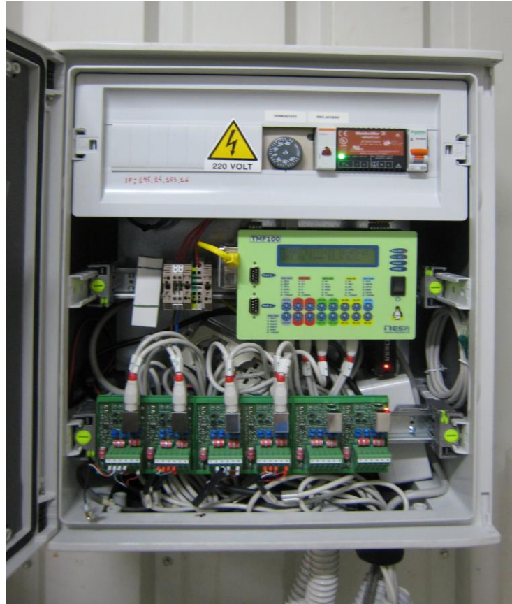
Fig. 5 - La stazione meteorologica Nesa: datalogger TMF100 e moduli M2Ch.