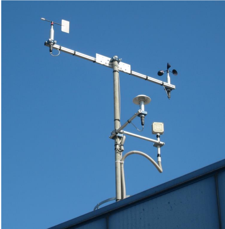
Fig. 7 - Anemometro Nesa (sensore di direzione a sin. e di velocità a ds.) e piranometro (sotto).