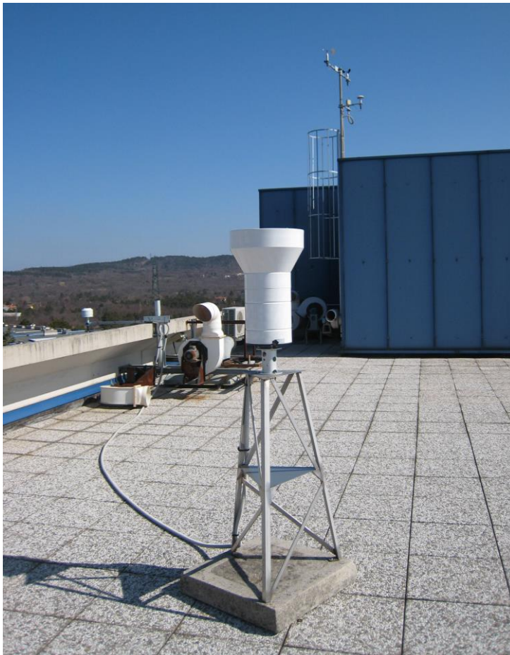
Fig. 8 - Pluviometro Nesa (in primo piano) e sensori vento e piranometro (sullo sfondo).